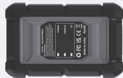
PHOENIX ELITE VCI DONGLE