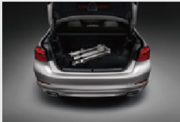
Foldable (Easy to carry)