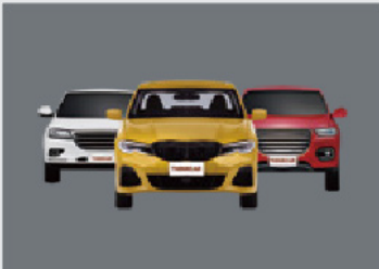
Wide Coverage (Support 98% car makes)