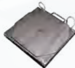
TURNPLATES & SLIP PLATES