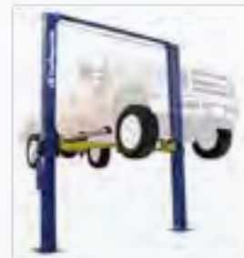
EXTENDED HEIGHT OPTIONS