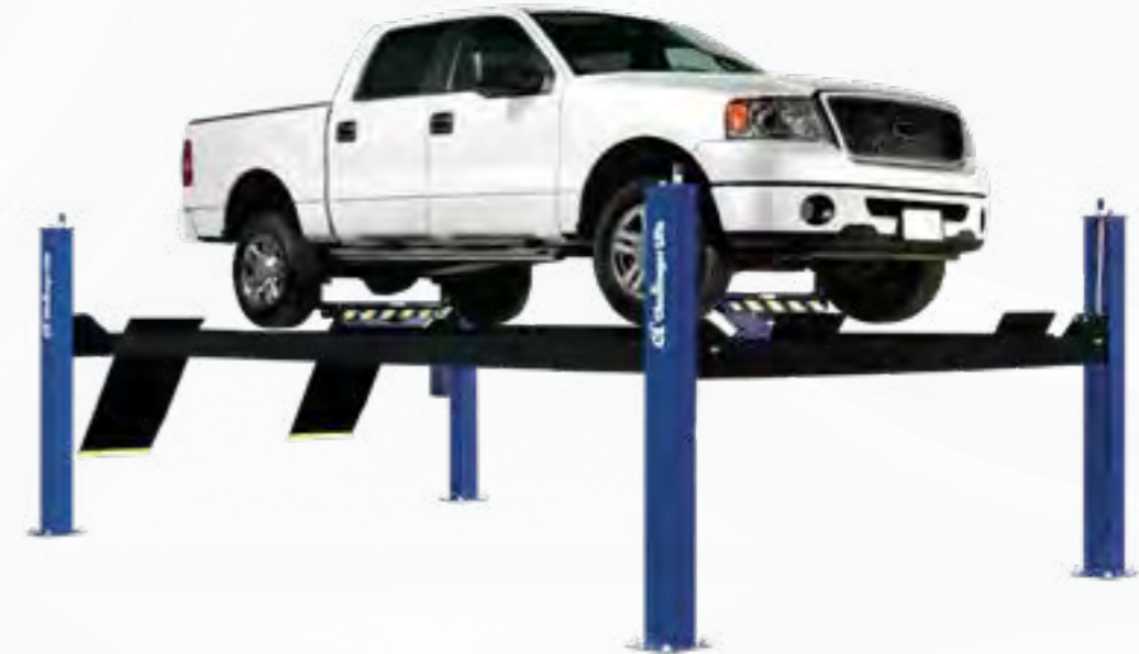
*RJ7.5 / Airline Kit / Additional Price